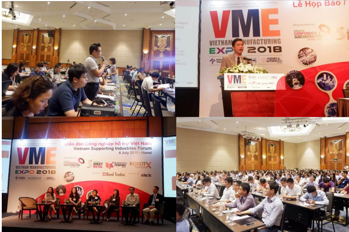
Exhibit space is open for reservation.

With manufacturing more competitive than ever, the manufacturing sector is entering the era of radical change that transforms the fundamental way manufacturers do businesses. To succeed and stay ahead of competitors, all of them should keep up with latest technologies and knowledges. In this regard, Reed Tradex Co., Ltd. , NC Network , Universal Robot , and Vietnam Electronic Industries Association (VEIA) have joined force to organize Vietnam Manufacturing Expo Forum 2018 with the topic of “Dialogue between the Supporting Industry Manufacturers” to help manufacturers catch up and share viewpoints of where the next manufacturing trend will be leading to.