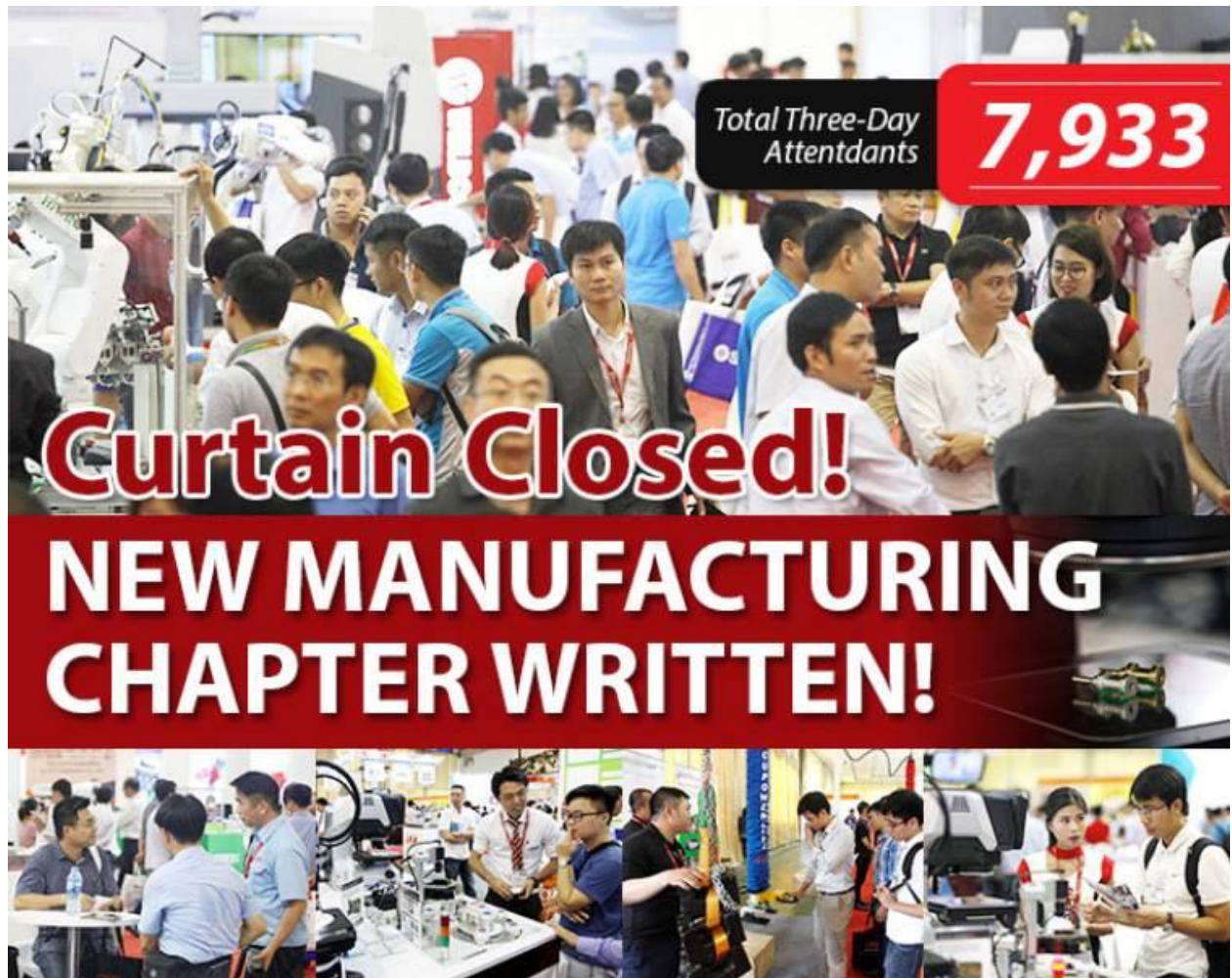
Exhibit space is open for reservation.

Vietnam ☎ +84 28 3822 4915/43 Thailand ☎ +66 2686 7299, +66 2686 7378 ✉ vietnammanufacturingexpo@reedtradex.co.th 🌐 www.vietnammanufacturingexpo.com 📘 www.facebook.com/vietnammanufacturingexpopage 📄 VME Vietnam Manufacturing Expo