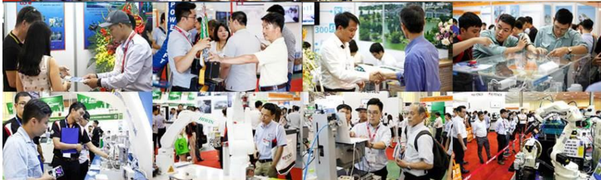
Exhibit space is open for reservation.