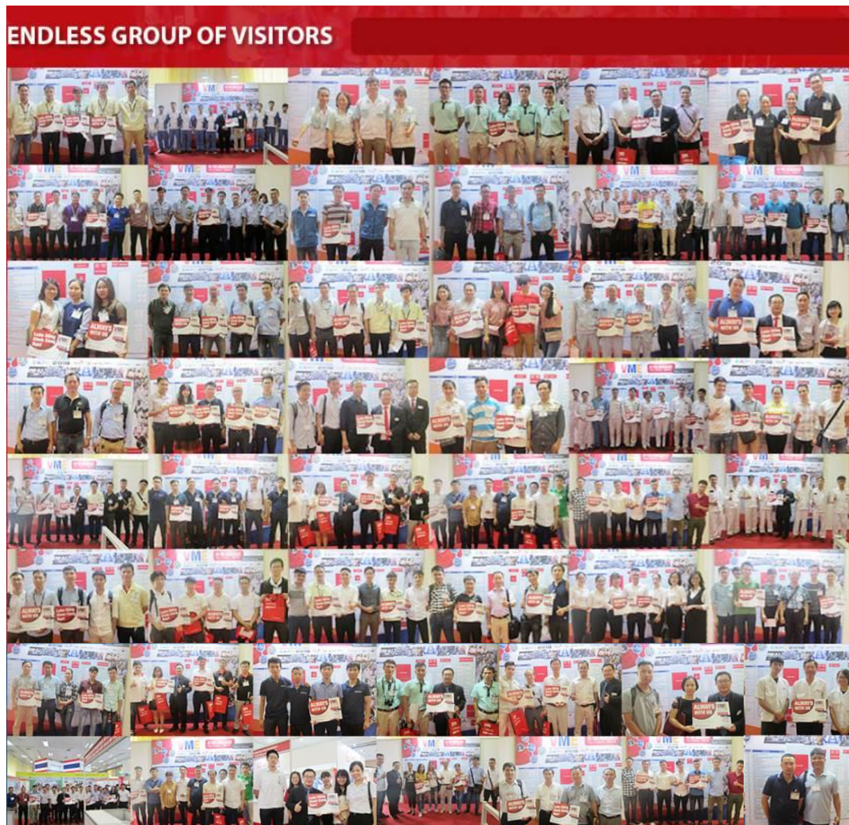
Exhibit space is open for reservation.

There are 313 groups of industrialists from various sectors paid their visits to all 5 shows to discover the state-of-the-art technologies and abundant sourcing opportunities for the plastics injection, mold making and supporting industries. They are presidents, general managers, directors, chief of engineers, factory managers, research and development specialists, purchasing managers, and many more. These groups represent the positive indicators that supporting industries are ready to move forward with enhanced production efficiency and business prosperity