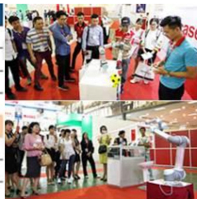
Exhibit space is open for reservation.